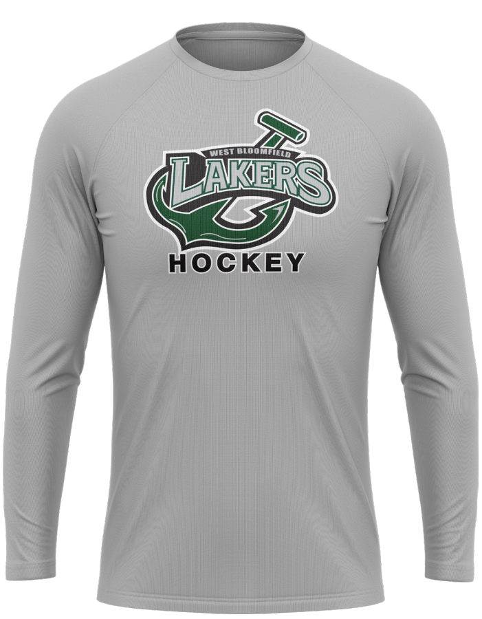
*Please note: These garments are not sublimated, screen printing only.

$Starting @ $20 Add Name: $5 *Minimum order of 12 Add Number: $ Add Number: $5