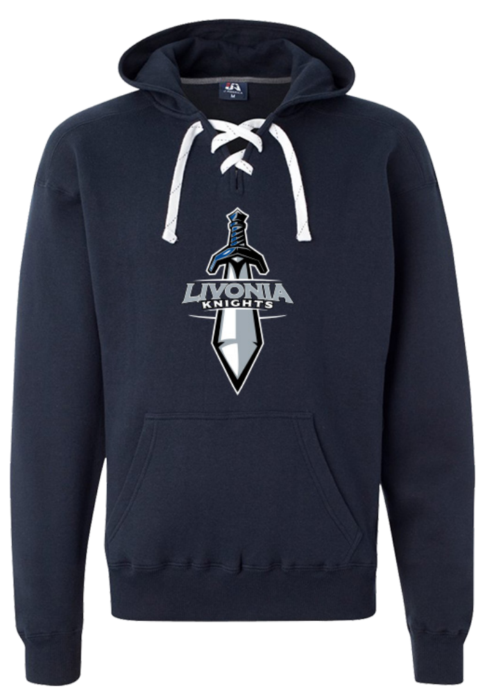
*Please note: These garments are not sublimated, screen printing only.