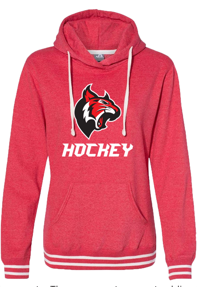
*Please note: These garments are not sublimated, screen printing only.